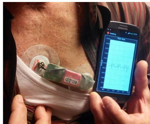
Figure 1: Prototype personal equipment of PCARD system: small body sensor and Smartphone.

To maximize their potential, wearable devices should be non-disruptive to their users; to this end, PCARD device is made small, multifunctional and wireless. It can be worn under any kind of garments. We have already successfully prototyped a differential wireless sensor for measuring body surface potential on short distances. One of the prototypes is shown in Figure 2 with the raw measured ECG signal displayed on the Android based smartphone.