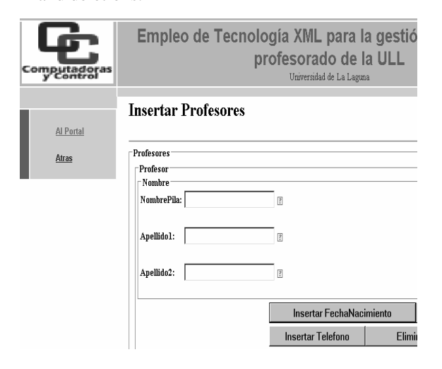
Figure 3: A detail of generated CV form